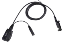
ACN-02-P UL913 Mic and PTT button with VOX and 3.5mm Jack Receive-only Earpiece (IP54)

External earpieces that are used in combination with the ACN-02-P