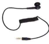
ES-01 Receive-Only Earbud