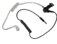
ES-02 Receive-Only Transparent Acoustic Tube