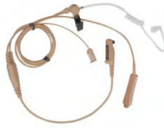
EAN21-P UL913 3-wire Surveillance Earpiece with Transparent Acoustic Tube