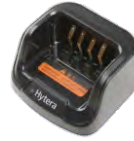
CH10L27 Drop-In Single Unit Charger