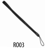
R003 Nylon Hand Strap

INCLUDED WITH THE HP702 UL913 and HP782 UL913