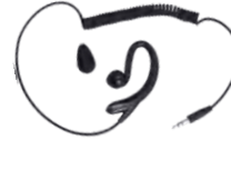
EH-01 Receive-Only C-Style Earloop