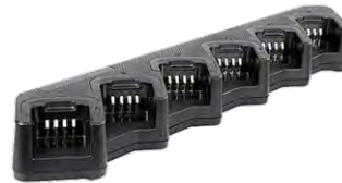
MCL32 6-Radio Multi-Unit Charger