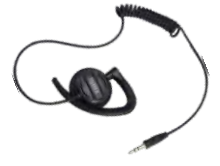
EH-02 Receive-Only Swivel Earpiece