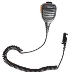
SM26N2-P UL913 Palm PTT Mic with Speaker and emergency button (IP54)