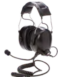
ECN21-P UL913 Noise-Cancelling Headset with PTT and boom microphone