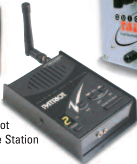
Patriot Base Station