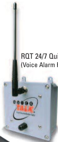
RQT 24/7 Quick Talk (Voice Alarm Reporter)