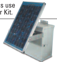
Optional Solar Kit

For remote applications use the Ritron RS-100 Solar Kit.